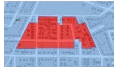
A “donut hole”

A donut hole is a property or group of properties entirely surrounded by the City (or in some cases, the City and another town or city). These are often areas that were developed prior to being adjacent to the City limits, and result in a patchwork of City, County, and private services in the area.